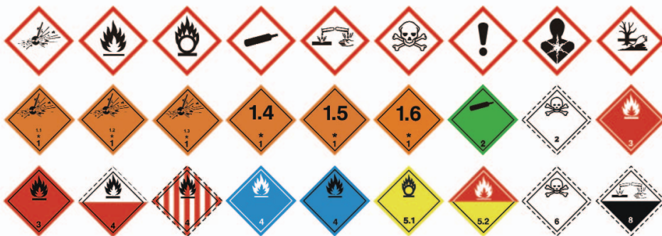
Label and pictogram images courtesy of Brandywine Drumlabels LLC.